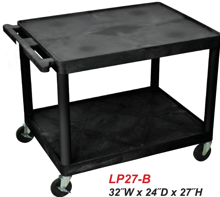
LP27-B 32"W x 24"D x 27"H