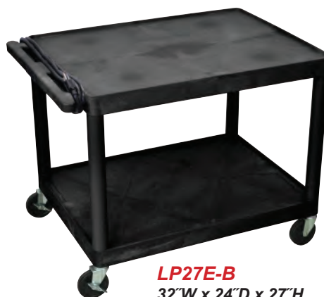
LP27E-B 32"W x 24"D x 27"H