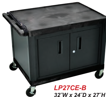
LP27CE-B 32"W x 24"D x 27"H