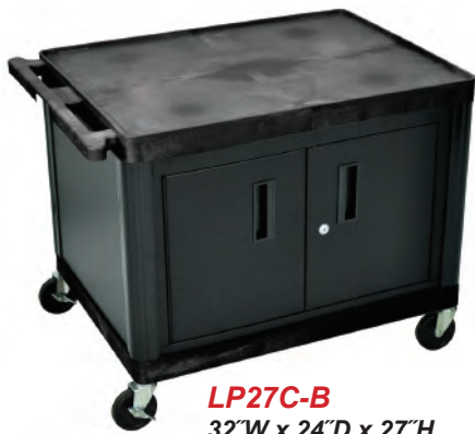
LP27C-B 32"W x 24"D x 27"H