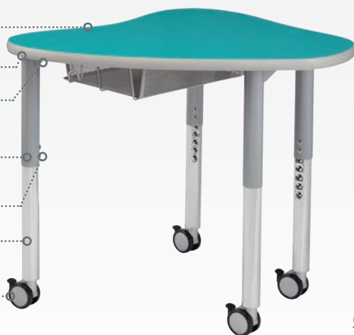
5200 - Synergy Desk

Standing Height Legs: Available in Black or Tungsten Color