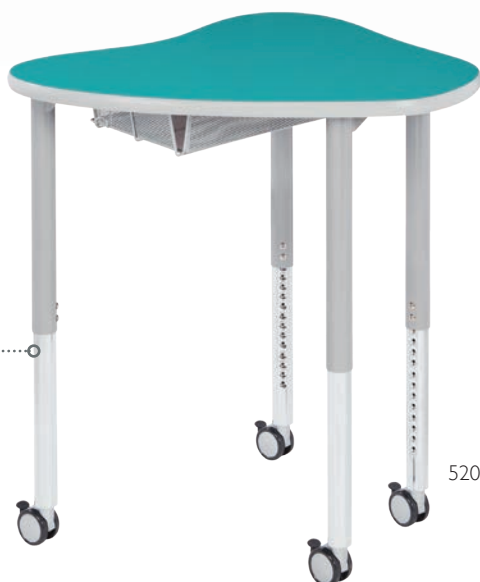
5200SH - Synergy Standing Height Desk