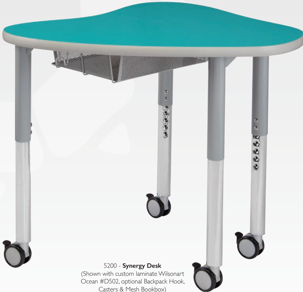
5200 - Synergy Desk (Shown with custom laminate Wilsonart Ocean #D502, optional Backpack Hook, Casters & Mesh Bookbox)