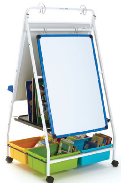
Rear removable double-sided dry erase board (lined on one side)

For further details, please visit our website or contact Customer Service. www.copernicused.com 1 800 267 8494